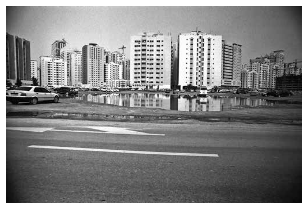
Figure 1. (Courtesy of the artist)