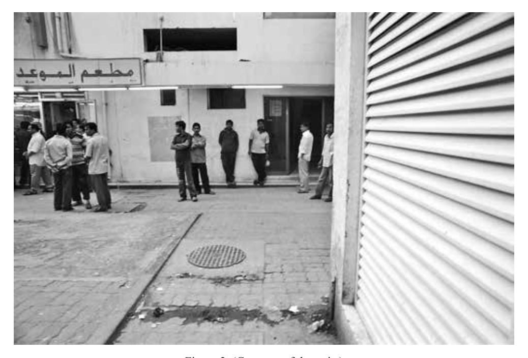
Figure 2. (Courtesy of the artist)