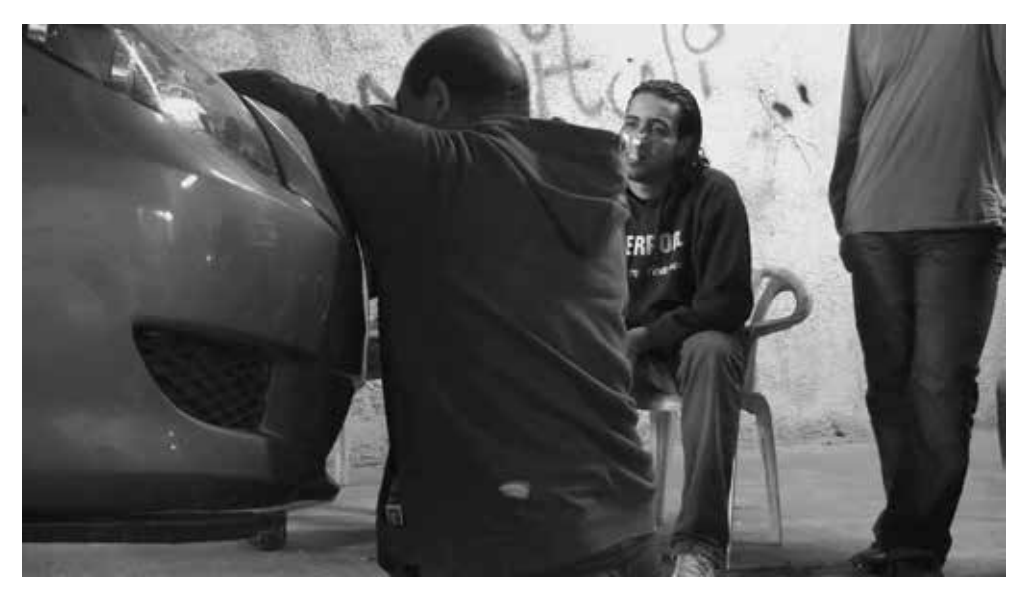
Figure 4. (Courtesy of the artist)