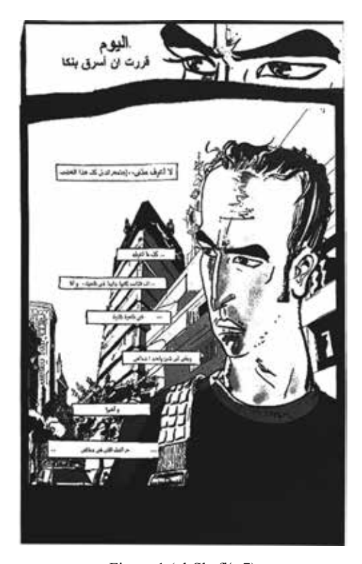
Figure 1 (al-Shāfi'ī 7)

at a Kefaya demonstration or by falling in love with Dina. The final sequence, when Shehab intends to symbolically leave the metro station called Mubarak, might be interpreted as the juncture where Shehab makes his dissent known: He leaves the subway, symbol of his underground activities and at the same time the political state under Mubarak. Like the other ki-fāya narratives, Metro exposes moments and feelings of kifāya , but it differs from them in its less generalizing representation of corruption, the optimistic vision of a vivid non-violent democratic opposition, and the subtle critique of resistance by all means possible. With respect to this critique I would like to analyze the predicament of violence and affects inherent to kifāya literature.