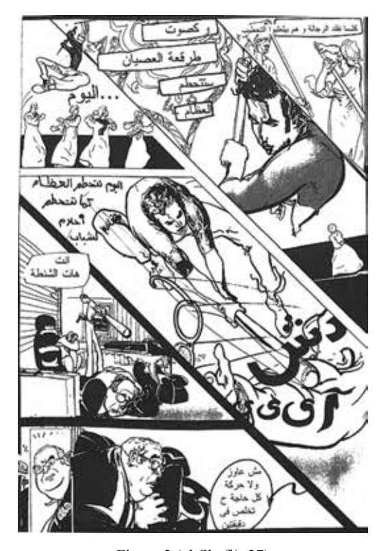
Figure 2 (al-Shāfi'ī 37)

namic diagonal; it is the sensation of a violent and pleasant dynamism that merges, to a certain degree, violence with pleasure.